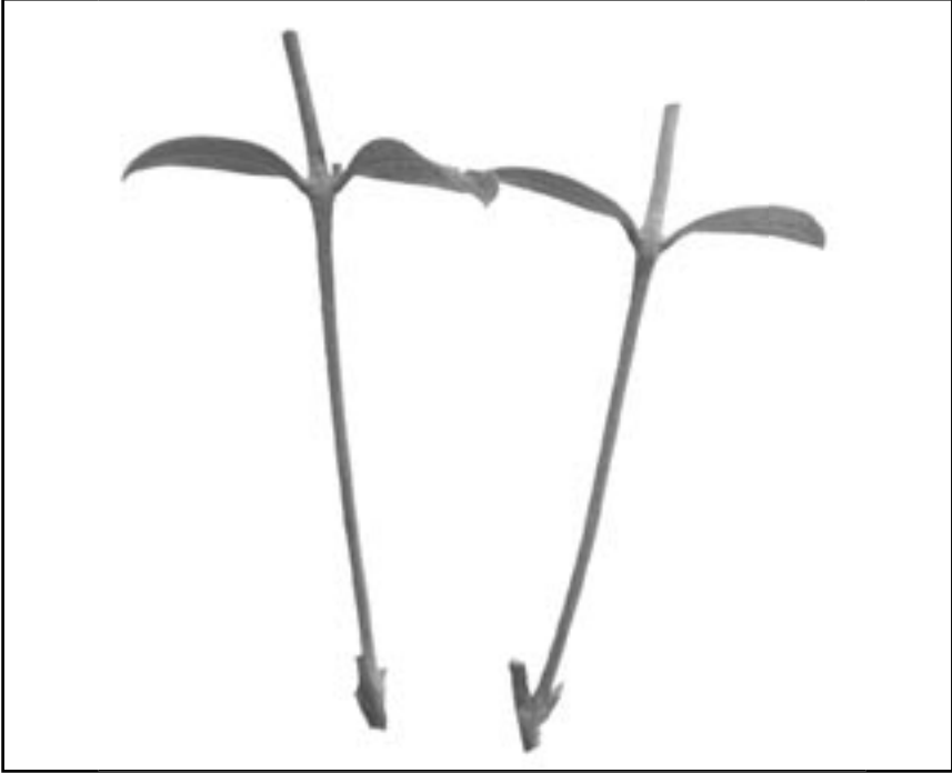
Figure 2. The remaining material is cut above and below the fork in the stem, and then split at the node.