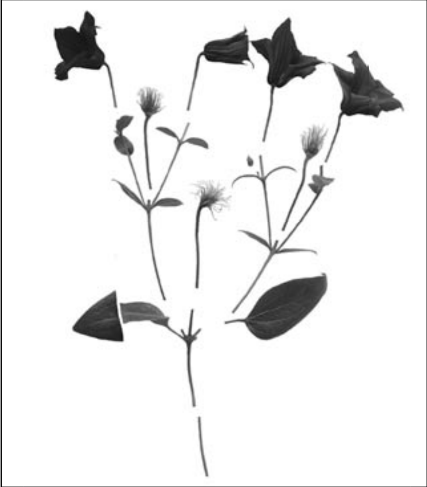
Figure 1. The basal cutting is removed and trimmed, along with the unwanted flower stems.

checked after 2 weeks. A 91% strike rate was achieved after 6 weeks. Those cuttings made from the split nodes usually produce shoots in the spring from dormant leaf axil buds in addition to the upper buds. Roots usually emerge from both the base and the edges of the cambium layer in the split node cuttings.