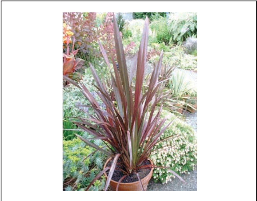
Figure 5. Phormium 'Merlot'.