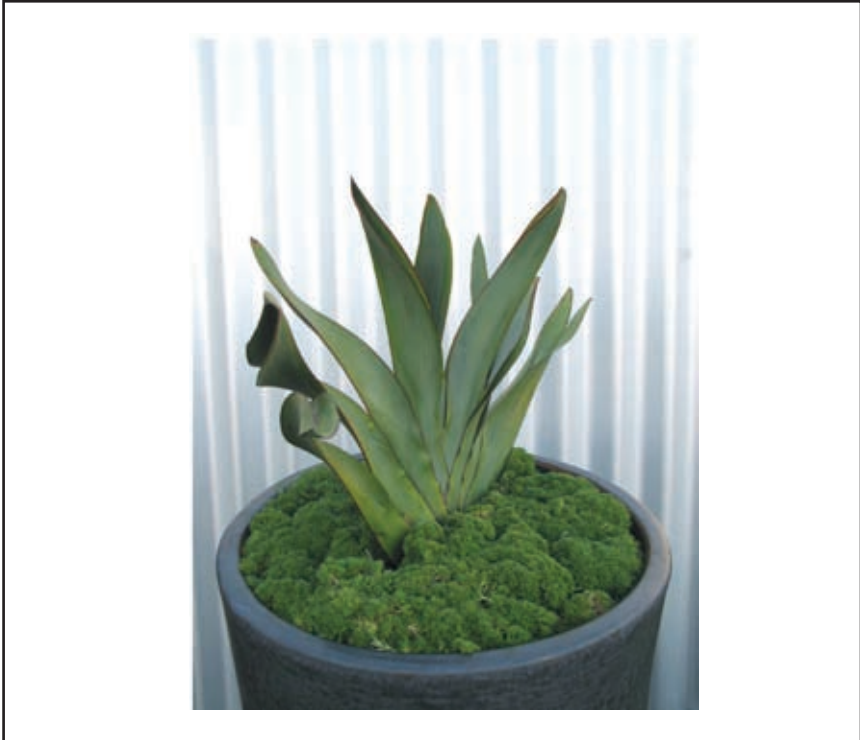
Figure 6. Phormium 'Twisted Sister'.

plant has extremely stiff olive green, twisted, and spiralling foliage, as if heated like hot molten metal, and then let cool. The foliage has an attractive grey-silver underside and bright orange leaf margins and midrib to complete the picture. All this makes 'Twisted Sister' the perfect architectural foliage plant for modern terrace and patio plantings; hardy; 0.4 × 0.4 m (Fig. 6).