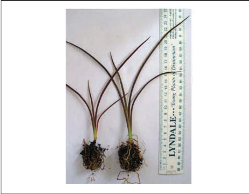
Figure 2. Phormium 'Merlot' 6-month-old plugs ready for transplanting.

Deflasking. Plants arrive from the lab in flasks of 30 plants. The plants are graded on arrival by height and set straight from the flasks into 128-cell trays. Best results are achieved when plants are between 40–50 mm in height at the time of deflasking.