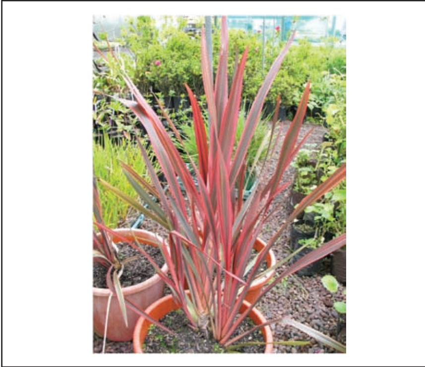
Figure 3. Phormium 'Red Dragon'.

resulting plants expressed some degree of colouration. Less than 1% shows the original characteristics of the variety.