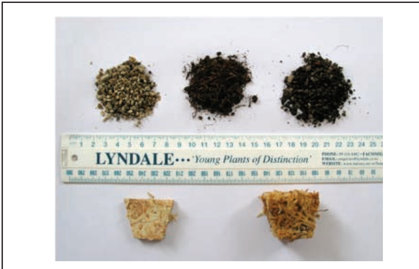
Figure 1. Media: Left to right (top row): pumice (3–5mm), peat, 90% pumice : 10% peat, (bottom row) compressed sphagnum, and expanded sphagnum.

Both media are used in a 128 cell trays (cell dimension 25 × 25 × 45 mm), these trays allow for good airflow between plants and allow for minimum root disturbance at the time of transplanting.