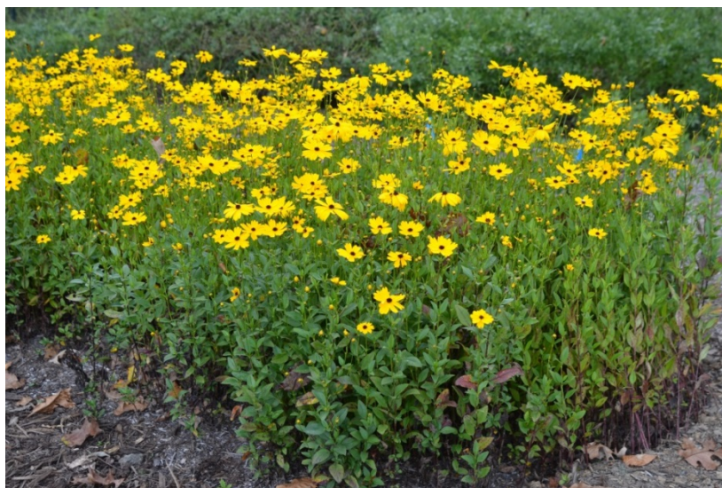
Figure 6. Coreopsis integrifolia 'Last Dance' flowering plants.

Coreopsis integrifolia 'Last Dance' is a selection by Sunny Border Nursery (Figure 6). Coreopsis Integrifolia is likely the least known species of Coreopsis and well underappreciated. Native to Florida stream banks, it likes wet soil, though average garden soil is fine. It is reliably hardy to Zone 5. Coreopsis integrifolia 'Last Dance' has beautiful, disease resistant foliage. Our one Horticulturist has never seen a disease spot on it. It is the last Coreopsis to flower, beginning in early October. There are several median plantings in Delaware with great preliminary success. At Mt. Cuba Center it is planted at our entrance, right on the edge of the road. This road is heavily treated for snow and ice in the winter and these plants do not suffer from that. It responds well to full sun and part shade conditions. Blooming late in the season it is slow to emerge in the spring. The rhizomatous growth makes it very easy to propagate by divisions. We are currently propagating from cuttings taken August 18, 2016 at Mt. Cuba Center greenhouses. UPDATE: 10/5/16—rooted cuttings potted, rooting success of cuttings 93%.