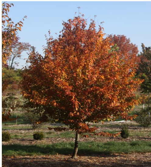
Figure 5. Carpinus caroliniana 'JN Select A', Fire King™ musclewood.

Carpinus caroliniana 'JN Select A' was selected by Michael Vanny at Johnson's Nursery in about 2003 for its consistent orange-red fall color (Figure 5), fast growth rate, excellent form and branching, and superior hardiness.