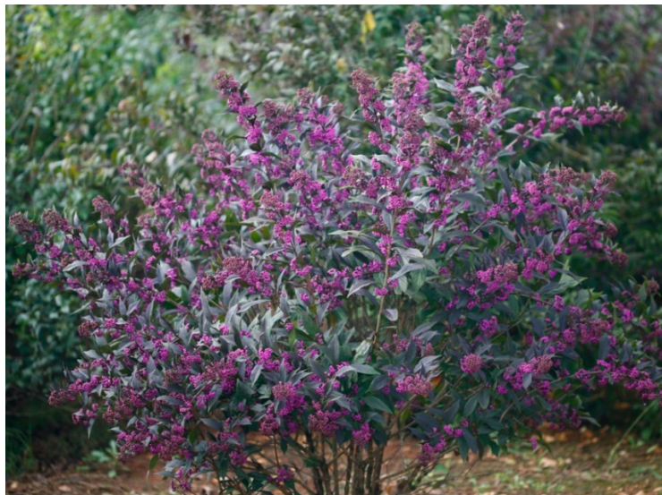
Figure 3. Callicarpa 'NCCX2', Pearl Glam® beautyberry fruiting plant.