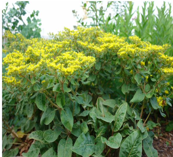
Figure 9. Eriogonum allenii 'Little Rascal' in flower.

This beautiful, long-flowering workhorse is a durable plant that thrives in urban plantings, rock gardens or any consistently dry site. It is drought tolerant and durable. With a tidy, low-growing habit of gray-green, paddle-shaped leaves, it bursts into flower with dense umbels of golden yellow flowers (Figure 9) that age to various shades of bronzy orange in the late summer. A wonderful little plant at 18-24 in. tall, it provides habitat and nectar for valuable pollinator species such as butterflies, honeybees, bumblebees, and hummingbirds. It is also a great selection for those who enjoy cut flowers. USDA Hardiness Zone 5-10.