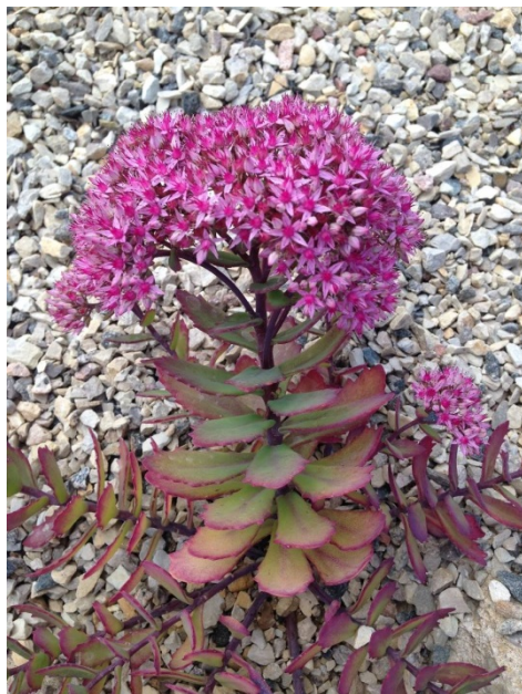
Figure 18. Sedum 'Peace and Joy' in flower.

An Intrinsic Perennial Gardens introduction. Bears blue-green foliage reminiscent of S. sieboldii in tight compact clumps, only reaching around 12 in. high and up to 15 in. wide (Figure 18). Bicolor magenta pink flowers begin in September. Place in full sun, well drained soil.