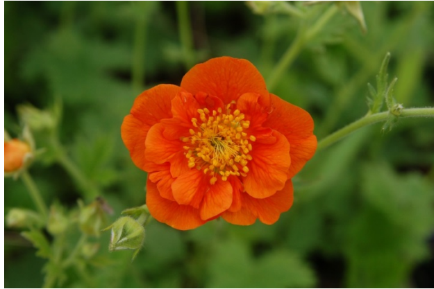
Figure 10. Geum 'Coppertone Punch' flower.