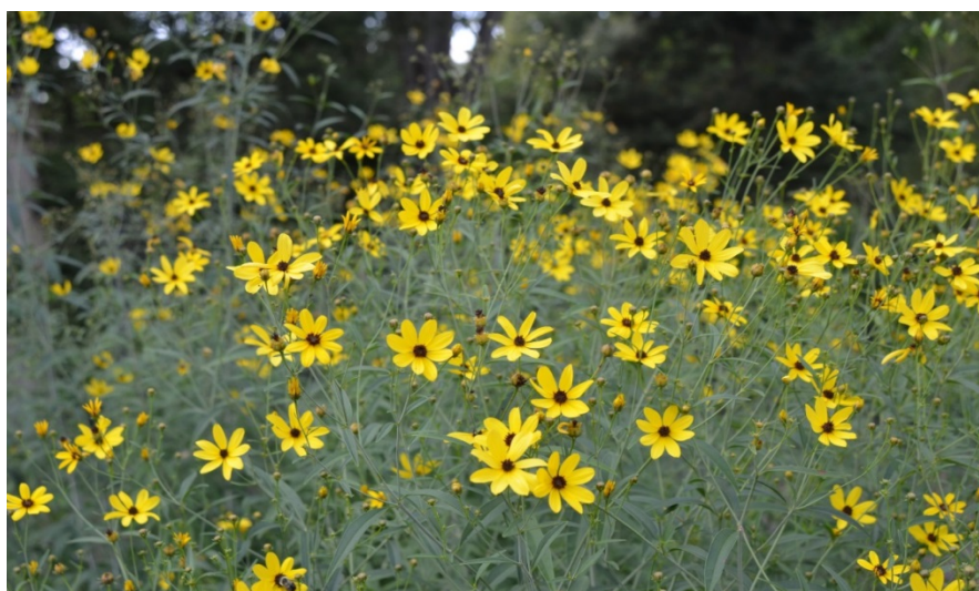
Figure 7. Coreopsis tripteris 'Gold Standard' flowering plant.

Coreopsis tripteris 'Gold Standard' is a new introduction from Mt. Cuba Center for 2016 (Figure 7). It is not widely available, yet. North Creek Nurseries is carrying. It was selected from seed collected in Jefferson County, Alabama. I remember cleaning and sowing this seed in the greenhouse in 2009! It is very winter hardy and experienced a span of harsh winters a few years ago. This is a full sun plant and unlike the straight species does not flop or break. The branches are held upright and extremely sturdy. 'Gold Standard' is slightly shorter than the straight species but will still reach 5 to 6 f tall. It blooms in late July for two solid months. We had mildew in the greenhouse on rooted cuttings this summer, but that cleared up with applications of Zeritol and increased air circulation. There was no mildew on the garden plants and otherwise it is disease resistant. It is a rhizomatous plant, spreading slowly, approximately 2 ft in 3 years. In the greenhouse we began 2016 with 11, 2 quart sized stock plants for our first cuttings in May. We took a series of five cuttings until flower buds set in late July. We have nearly 500, 1-qt pots to date and we are not a production greenhouse. One can see how quickly it can be multiplied. Additionally, stock plants are a sellable 3 gal, blooming plant in September. There is a propagation protocol, posted by myself, on the Native Plant Network for the straight species which was based on these plants.