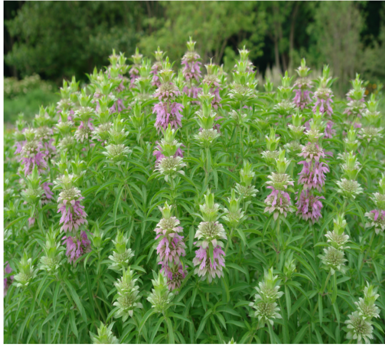
Figure 16. Monarda punctata in flower.