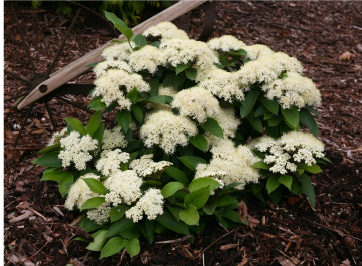
Figure 20. Viburnum cassinoides 'SMNVCDD', Lil' Ditty® witherod viburnum flowering plant.

Outstanding dwarf viburnum is a puffball of creamy-white flowers in late spring (Figure 20). The fruit eventually turns black and remains on the plant to provide winter interest and food for songbirds. An adaptable, easy to grow landscape shrub that is perfect for mass plantings, foundations, and the outer edge of water gardens. Native.