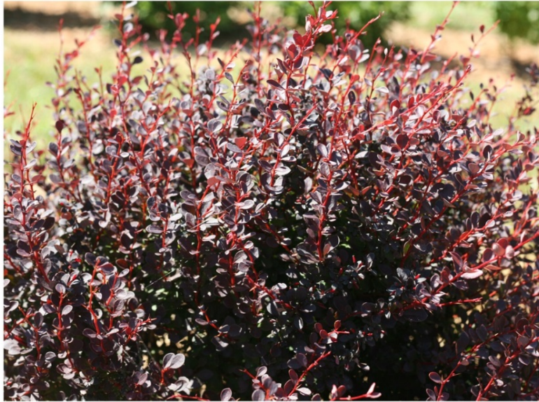
Figure 2. Berberis thunbergii f. atropurpurea 'NCBT1', Sunjoy Mini Maroon™ Japanese barberry showing the low mounded habit.