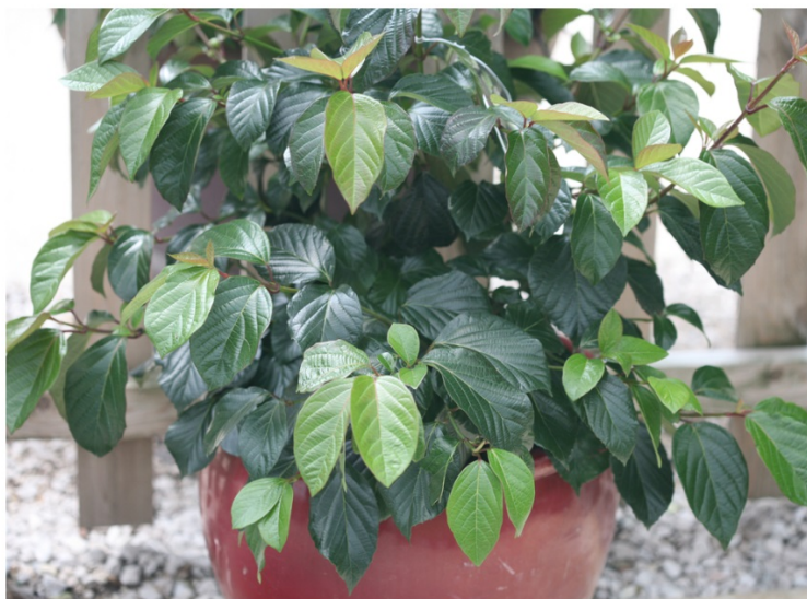
Figure 21. Viburnum 'NCVX1', Shiny Dancer™ viburnum plant.

An extraordinary compact viburnum, noted for its waxy leaves that are tinged with an attractive red margin. Abundant ivory flowers adorn this shrub in spring (Figure 21). The dark green, heavily textured, semi-evergreen foliage turns burgundy-red in late autumn. This easy to grow, adaptable landscape plant was developed by Dr. Tom Ranney of NCSU by crossing V. 'Huron' with V. 'Chippewa'. Use either parent as a pollinator for a crop of persistent dark red fruit.