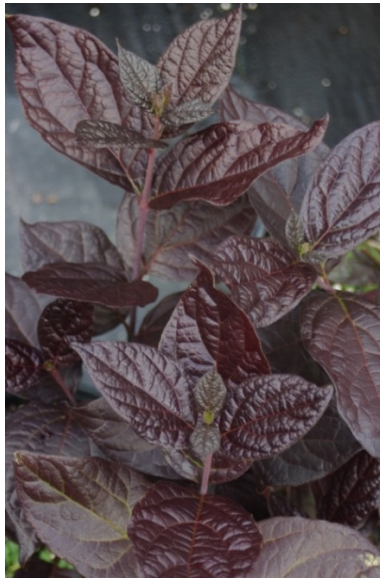
Figure 4. Calycanthus floridus var. glaucus 'Burgundy Spice' foliage.

The maroon flowers appear in May and June, and have the classic mango and pineapple fragrance of good sweetshrub selections. The fall foliage adds another season of enjoyment, turning attractive shades of yellow and amber.