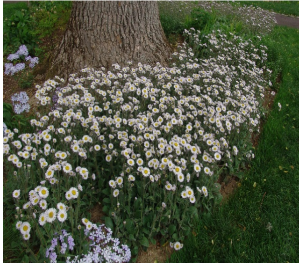
Figure 8. Erigeron pulchellus 'Lynnhaven Carpet' in flower.