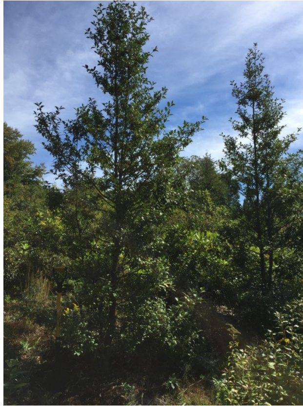
Figure 15. Ilex opaca 'Weston' form.

By the 1990s we had sufficiently evaluated this holly's performance in containers and open-field plantings to realize it was worthy of a cultivar name, so I initially called it 'Mae West' (I don't believe we've sold it using that name). When young it grows rapidly and quite upright, readily trainable to a single trunk, perhaps well-suited for narrow spaces. It has thrived for many years with minimal foliage damage in our Zone 5 winters in the open field, full sun and wind, flowering normally each spring and producing a lot of fruit, making a fine cut branch over the holidays. After a few more years and further testing, we realized that this was an unusually-precocious cultivar, reliably producing profusions of smaller-than-typical berries that were as appealing as its foliage. At that point I chose to discard its original moniker and name it 'Weston' as a more appropriate designation for this superior cultivar.