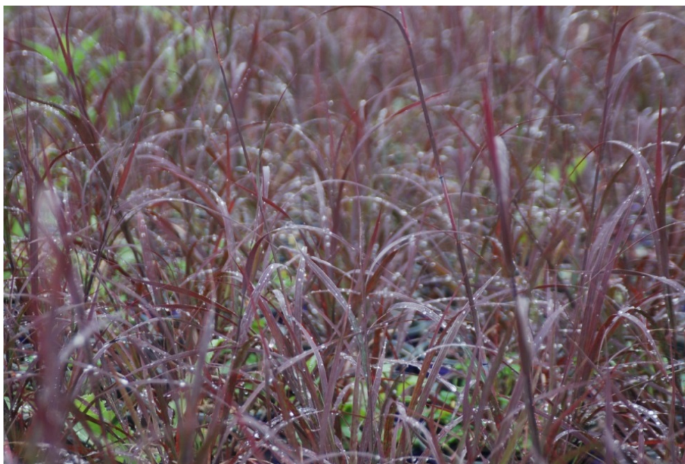
Figure 1. Andropogon gerardii 'Blackhawks' foliage.

Andropogon gerardii 'Blackhawks' big bluestem is a 2016 Intrinsic Perennial Gardens introduction. Deeper green foliage of this big bluestem selection takes on a deep purple background in mid-summer, deepening to dark purple and near black in some parts of the plant (Figure 1). Upright 5 ft+ tall plants will stand out in the landscape, especially with other tall grasses. For full sun, average soil.