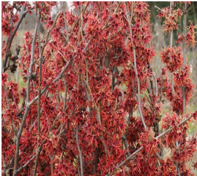
Figure 11. Hamamelis vernalis HAP#1002 ( H. vernalis 'Holden' × H. vernalis 'Amethyst') flowers.

Hamamelis vernalis HAP#1002 is an unnamed hybrid from Holden Arboretum using H. vernalis 'Holden' × H. vernalis 'Amethyst' (Figure 11). It has excellent dark green leaves, good autumn leaf color, and good disease resistance. HAP#1002 has red flowers and is in flower between Thanksgiving and Christmas—the only selection we are aware of that does this. Not patented or trademarked, not in general commerce.