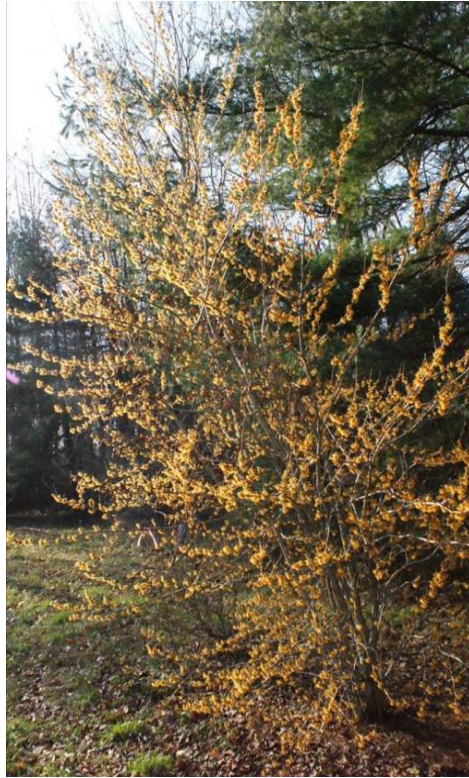
Figure 12. Hamamelis virginiana × H. vernalis 'Winter Champagne' in flower on 25 December 2012.

Purchased as Hamamelis virginiana , grew to approximately 12 ft tall, drowned in 2013, named by Brotzman's Nursery. Flowers yellow between Halloween and Thanksgiving and flowers remain intact and colorful into the New Year, usually until early February (Figure 13). All flowers open in the fall but have the ability to persist through the winter without completely drying out or dropping off. The only selection we are aware of that has this characteristic.