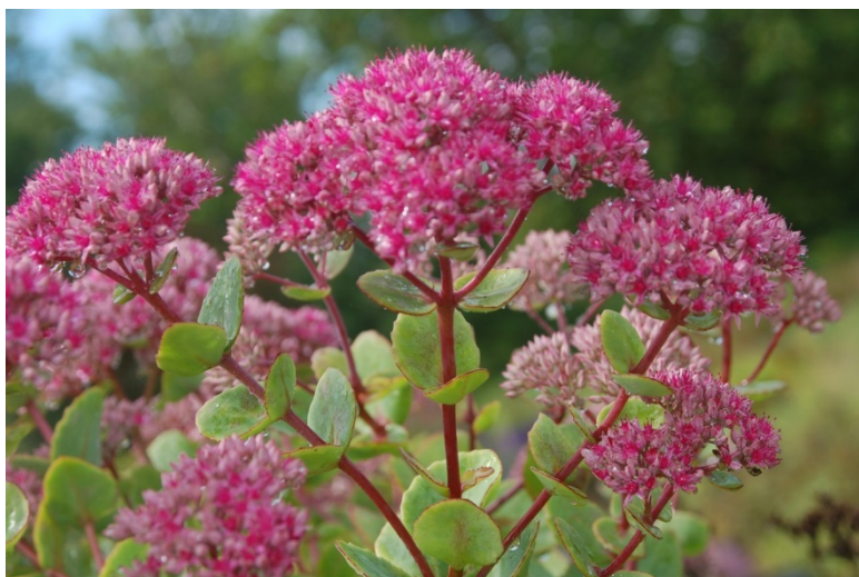
Figure 19. Sedum 'Pillow Talk' in flower.

A 2016 Intrinsic Perennial Gardens introduction. Substantial plants with hybrid vigor reach 18-24 in. tall and wide. 5-6 in. flower heads of deep pink and magenta stand out from the crowd (Figure 19). Large, gray-green foliage is held on rose colored stems and at times displays reddish edges. Fall color is chartreuse and pink. This selection is resistant to Rhizoctonia . For full sun to light shade, well-drained soil is best.