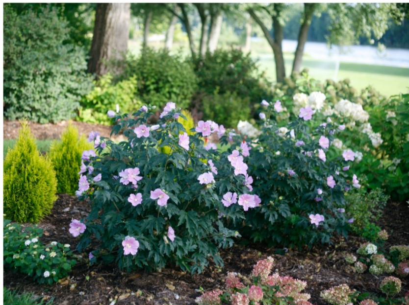
Figure 14. Hibiscus 'Rosina', Pollypetite™ hibiscus flowering plant.

A most unusual and beautiful dwarf H. paramutabilis × H. syriacus hybrid. This ball-shaped shrub has large, rounded, pure lavender-purple flowers with soft ruffled edges and no center eye (Figure 14). Very dark green leaves provide striking contrast. Developed by Polly Hill Arboretum on Martha's Vineyard.