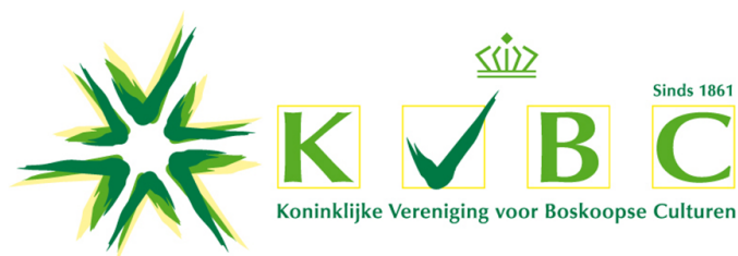
Figure 1. Koninklijke Vereniging voor Boskoopse Culturen logo.

The Koninklijke Vereniging voor Boskoopse Culturen [Royal Boskoop Horticultural Society (RBHS)] has a long history in assessing plants (Figure 1). The society was founded in 1861 with the main goal “to put the correct names to the plants grown.” The board members used to visit nurseries themselves to check plants and correct naming. The Trials Committee was founded in 1895 and the first four awarded plants all received an “Award of Merit”. Among those were Sambucus racemosa ‘Plumosa Aurea’ and Spiraea japonica ‘Anthony Waterer’; still widely grown and still recommended.