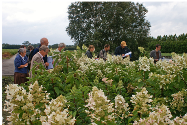
Figure 6. Euro-Trials Hydrangea paniculata in Boskoop, The Netherlands, 2007.

In several European countries plants are assessed primarily on ornamental value, suitability as a garden plant or suitability for amenity use, health, winter hardiness etc. In February 2002, co-operation between the Netherlands and Germany in trialling plants was established and it was agreed that cultivars of Hydrangea paniculata (Figure 6) would be the first group to be trialled internationally. The German trials committee is formed by the Bund deutscher Baumschulen (BdB) backed by the Bundessortenamt (German Plant Variety Rights Office). Before collecting and propagating the plants, co-operation was sought with the Royal Horticultural Society (RHS) and the French Agro Campus Ouest (University of Angers).