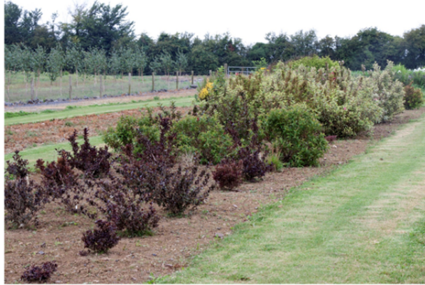
Figure 5. Euro-trial of Weigela in Stoneyford, Ireland, 2011.