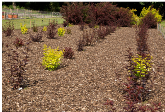
Figure 9. Euro-trial Physocarpus , RHS Wisley, United Kingdom, 2017.

In 2017 preparations for a seventh Euro-trial are being made (Figure 10). In this trial low-growing taxa of Spiraea will be assessed. The Finnish research station, LUKE, will coordinate this project.