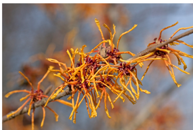
Figure 4. Hamamelis × intermedia 'Aphrodite'; *** in the 2002 trial of Hamamelis .

The RBHS is not unique in performing these kinds of trials. In other European countries plants are assessed in a similar way. In 2002 this resulted in an international co-operation, called Euro-trials.