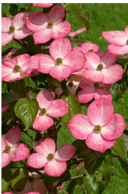
Figure 3. Cornus kousa 'Satomi' First Class Certificate, 1986.

The basic type of trial conducted by the RBHS is the so-called "Field Trial". A Field Trial always concerns one cultivar, new to the market that is planted in the field (in a batch of 10 plants). Each plant is trialled according to standard criteria that basically have not changed during the committees' history: ornamental value, suitability as a garden plant or for amenity use, health, winter hardiness, and differences to similar cultivars. Apart from these criteria, special criteria for specific plant groups can be added. Each plant is assessed as many times as is needed during the year to come to a final verdict. The following awards are possible: KVBC-Award Bronze, KVBC-Award Silver, and KVBC-Award Gold. Among the hundreds of awarded plants are many familiar ones: Acer palmatum 'Garnet' (First Class Certificate; 1962), ( Buddleja 'Pink Delight' (First Class Certificate; 1985), Chamaecyparis lawsoniana 'Stewartii' (First Class Certificate; 1906), Cornus kousa 'Satomi' (First Class Certificate; 1986) (Figure 3) and Ilex aquifolium 'J.C. van Tol' (Award of Merit; 1904), to name but a few.