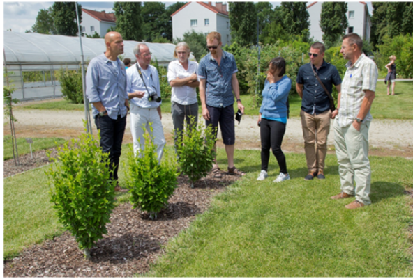
Figure 7. Discussion about Hibiscus , Vienna, Austria, 2016.