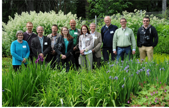
Figure 10. The Euro-trials group in Piikkiö, Finland, 2014.

Since the first international trial ended and several trials are ongoing, the participants are eager to continue the process. Each year the participants hold an annual meeting. During these meetings all possible Euro-trials related topics are discussed, as well as proposed new trial subjects.