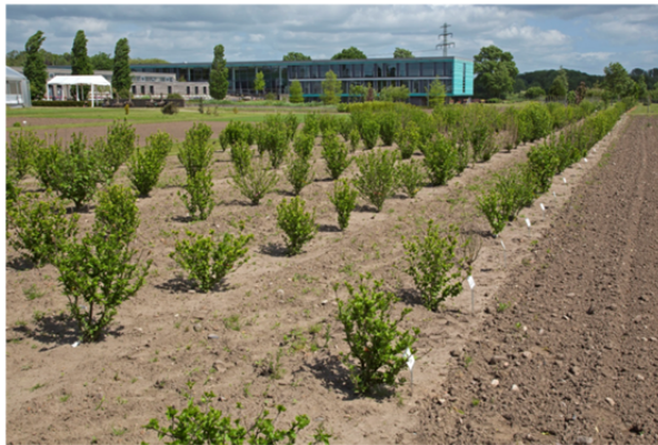
Figure 8. Euro-trial Hibiscus , Ellerhoop, Germany, 2017.