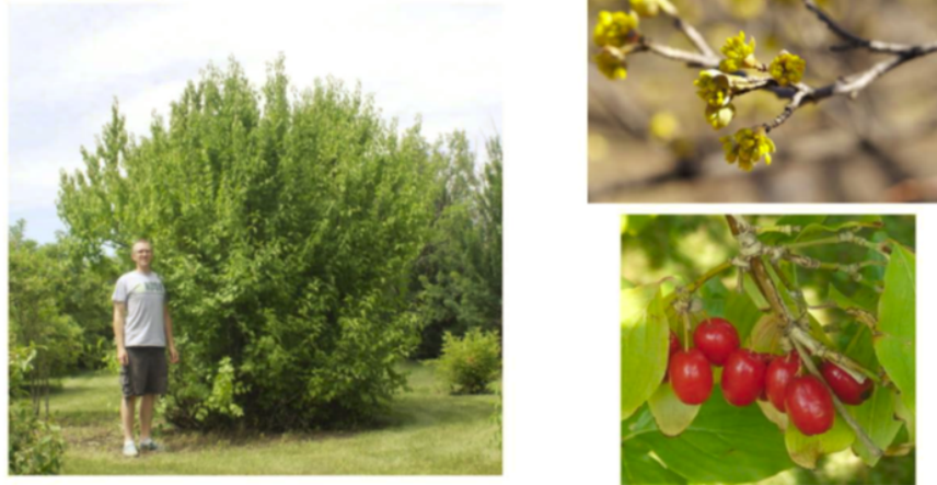
Figure 2. Cornus mas plant, flowers, and fruit.

For plant evaluation, selections and breeding, germplasm is collected from three different methods including: