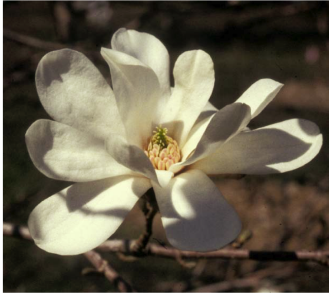
Figure 3. Spring Welcome® magnolia.