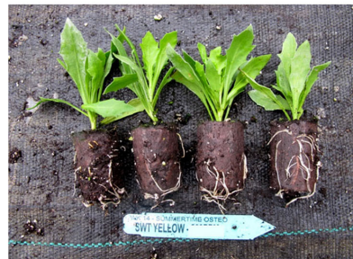
1200 ppm IBA One Treatment