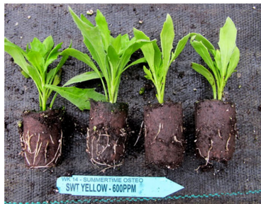
600 ppm IBA One Treatment