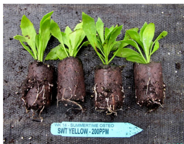
200 ppm IBA One Treatment