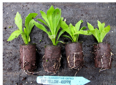
400 ppm IBA One Treatment