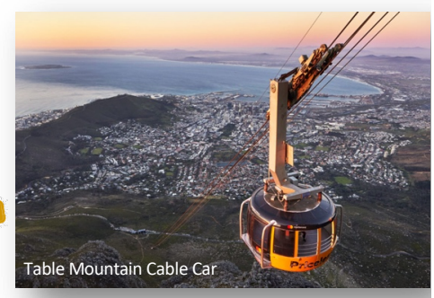
Table Mountain and the Cable Car for Picturesque views over Cape Town, combined with its fauna and flora, is a spectacle to behold, now an official New 7 Wonder of Nature. tablemountain.net

Lunch at Roundhouse Restaurant overlooking Camps Bay